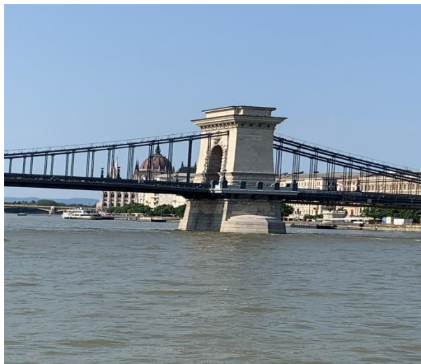
Bridge on the Danube

One day has to be spent on the Danube River. Starting with the Chain Bridge, the Royal Castle, the Fisherman Bastion, and the House of Parliament, we experienced a century of architectural marvels.