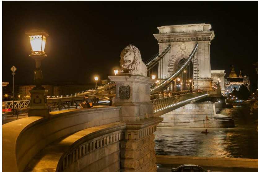
The Chain Bridge

The Chain Bridge is a 19th-century suspension bridge, which spans the Danube River connecting the Pest and Buda sides of the city.